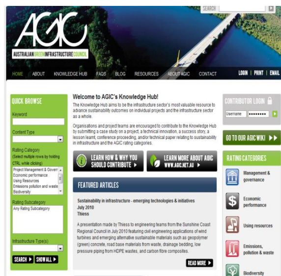
Indicative mockup of Knowledge Hub home page