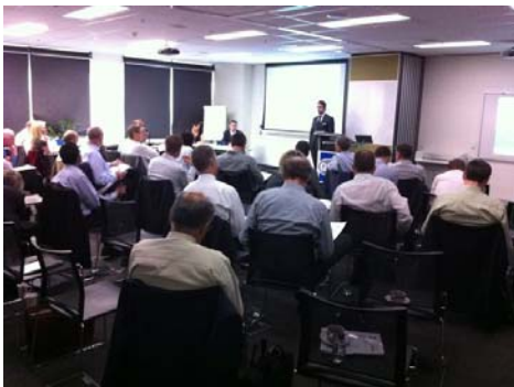
Category authors gain a common understanding at the Sydney briefing

While the remaining funds are yet to be secured from government and private sources, the remaining two themes (Economic Performance, Workforce) will be developed and merged with the Pre-Pilot Trial version ready for formal pilot trials.